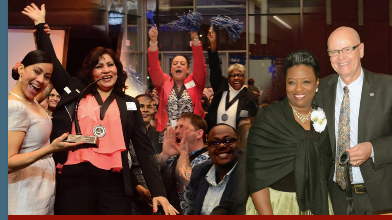
PAY TRIBUTE TO YOUR STAR PERFORMERS

GHLA's Stars of the Lodging Industry Awards program was created nearly 50 years ago by the American Hotel & Lodging Association to recognize outstanding accomplishments in the lodging industry. The Georgia Hotel & Lodging Association is pleased to host our own local "Stars" program to honor lodging industry associates and properties that embody quality service and the spirit of hospitality right here in Georgia! This is your opportunity to recognize those employees who go the extra mile for your guests, your property, and your community!